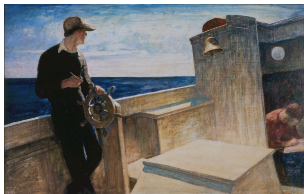
Eight Bells (Clyde, Stanley and Andrew Wyeth about Eight Bells), 1937, N.C. Wyeth (American, 1882-1945), oil on hardboard, Bank of America Collection

For three generations, the Wyeths have created art that captures the imagination and admiration of a wide audience. This exhibition presents more than sixty paintings, drawings, and illustrations by N.C. (Newell Converse) Wyeth, his son Andrew Wyeth, and his grandson Jamie Wyeth. The works – from the early 1900s to the early 2000s – reveal the breadth of the Wyeth family's creative output and illuminate both common themes within the works and the artists' individual styles.